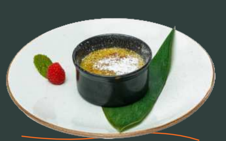
抹茶クリームブリュレ Matcha Crème Brûlée 6.9

Please let a member of staff know if you have any allergies or dietary requirements and they will be happy to assist you.