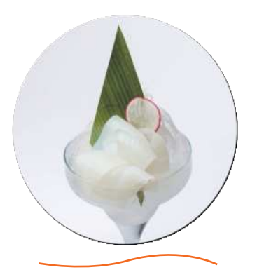
イカ SQUID 6.5