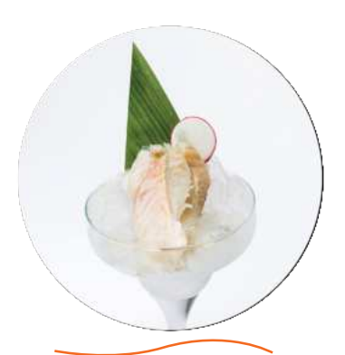
タイ SEA BREAM 6.9