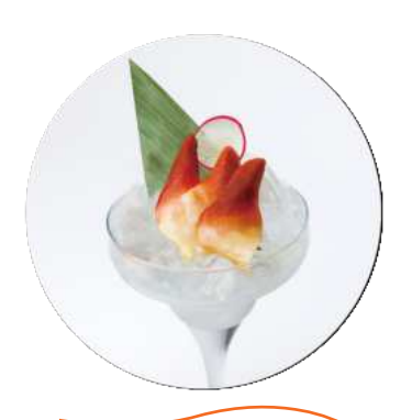
ホッキ貝 SURF CLAM 6.9