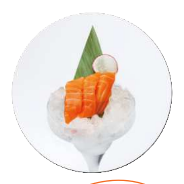
サーモン SALMON 6.5