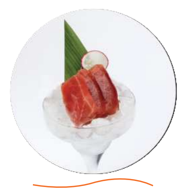
マグロ RED TUNA 7.2