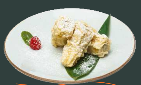
バナナフリッターバニラアイス添え Banana Fritter with Vanilla Ice Cream 6.9