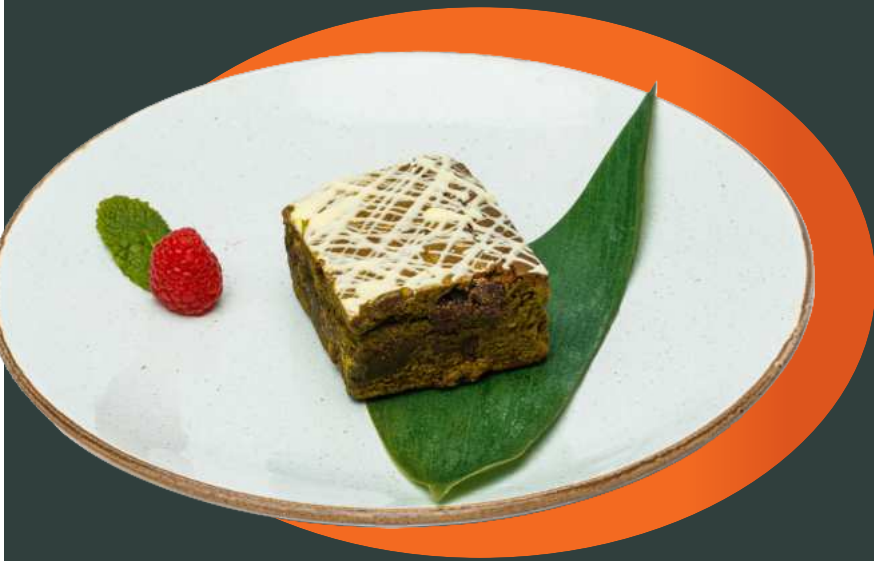
チョコレート抹茶ブラウニー バニラアイス添え Chocolate Matcha Brownie with Vanilla Ice Cream