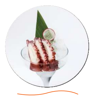
タコ OCTOPUS 6.9