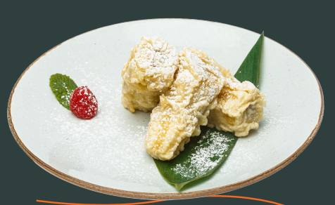
バナナフリッターバニラアイス添え Banana Fritter with Vanilla Ice Cream