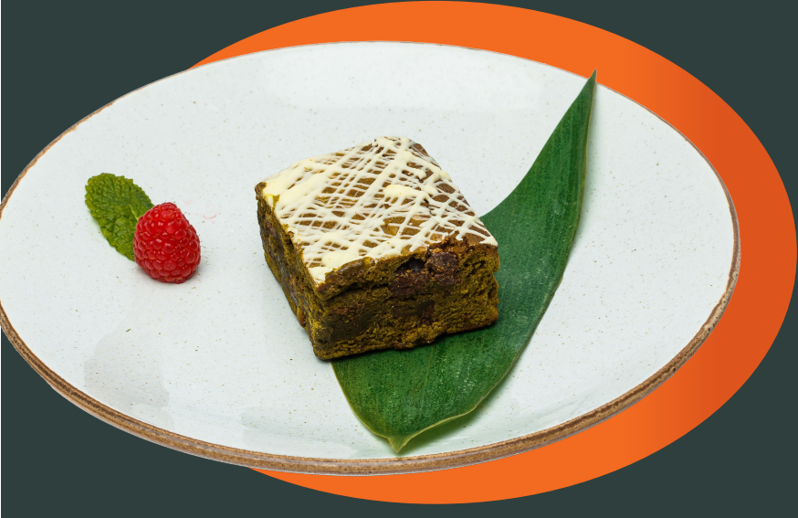
チョコレート抹茶ブラウニー バニラアイス添え Chocolate Matcha Brownie with Vanilla Ice Cream