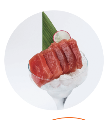
マグロ RED TUNA