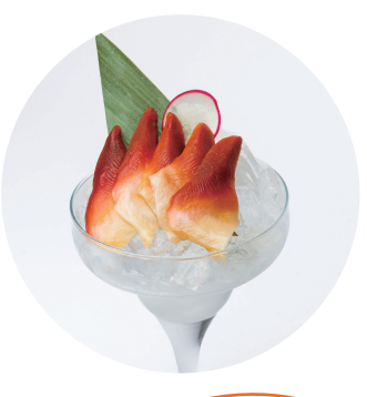
ホッキ貝 SURF CLAM