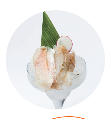
タイ SEA BREAM