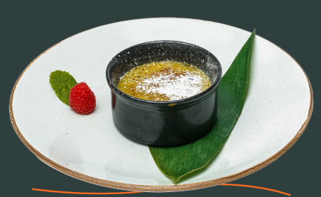
抹茶クリームブリュレ Matcha Crème Brûlée

Please let a member of staff know if you have any allergies or dietary requirements and they will be happy to assist you.