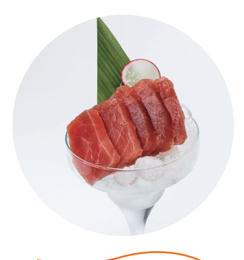
マグロ RED TUNA 7.5