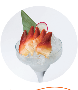
ホッキ貝 SURF CLAM 7.5