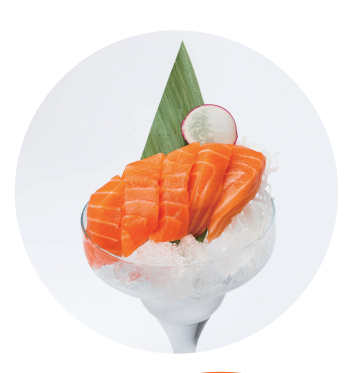
サーモン SALMON 7.5

3 Slices of Red Tuna Sashimi 3 Slices of Salmon Sashimi 3 Slices of Sea Bream Sashimi 14.5