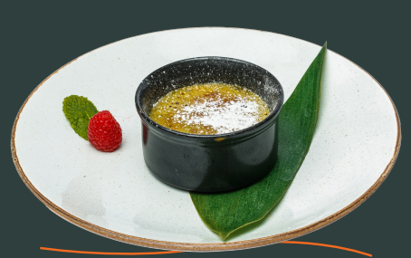
抹茶クリームブリュレ Matcha Crème Brûlée 6.9

Please let a member of staff know if you have any allergies or dietary requirements and they will be happy to assist you.