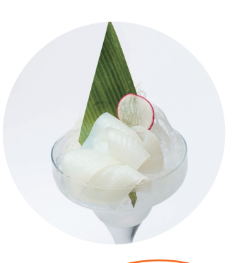
イカ SQUID 7.5