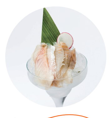
タイ SEA BREAM 7.5