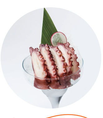
タコ OCTOPUS 7.5