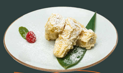
バナナフリッターバニラアイス添え Banana Fritter with Vanilla Ice Cream 6.9