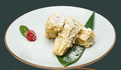
バナナフリッターバニラアイス添え Banana Fritter with Vanilla Ice Cream