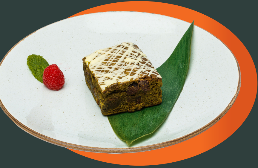
チョコレート抹茶ブラウニー バニラアイス添え Chocolate Matcha Brownie with Vanilla Ice Cream 6.9