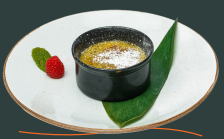
抹茶クリームブリュレ Matcha Crème Brûlée

Please let a member of staff know if you have any allergies or dietary requirements and they will be happy to assist you.