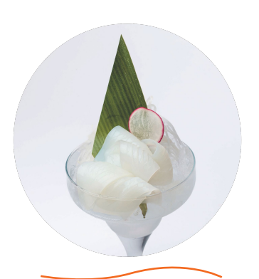
イカ SQUID 6.5