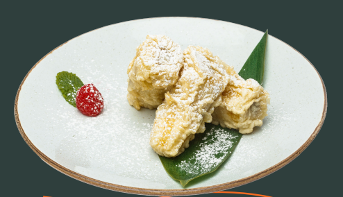
バナナフリッターバニラアイス添え Banana Fritter with Vanilla Ice Cream 6.9