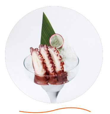
タコ OCTOPUS 6.9