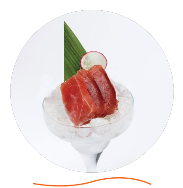
マグロ RED TUNA 7.2