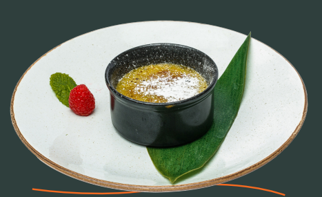
抹茶クリームブリュレ Matcha Crème Brûlée 6.9

Please let a member of staff know if you have any allergies or dietary requirements and they will be happy to assist you.