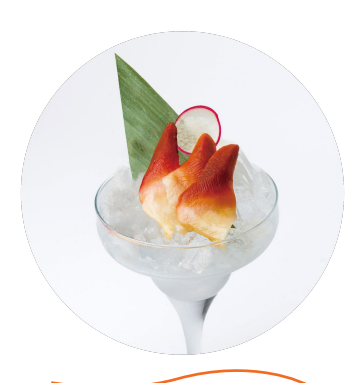
ホッキ貝 SURF CLAM 6.9