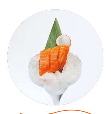
サーモン SALMON 6.5

3 Slices of Red Tuna Sashimi 3 Slices of Salmon Sashimi 3 Slices of Sea Bream Sashimi 17.9