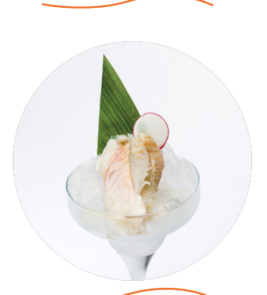
タイ SEA BREAM 6.9