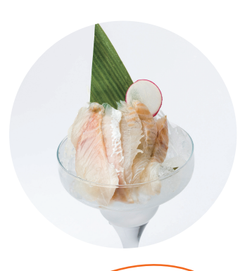
タイ SEA BREAM 7.5