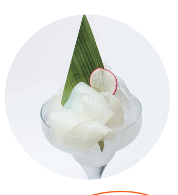
イカ SQUID 7.5