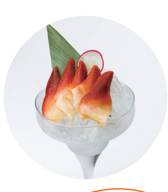
ホッキ貝 SURF CLAM 7.5