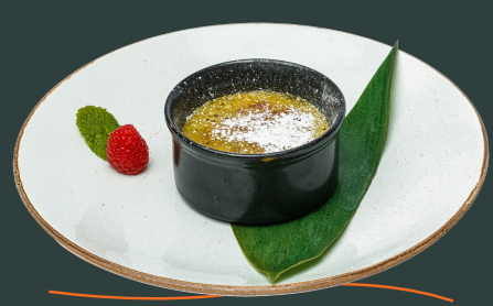
抹茶クリームブリュレ Matcha Crème Brûlée

Please let a member of staff know if you have any allergies or dietary requirements and they will be happy to assist you.