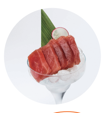
マグロ RED TUNA 7.5