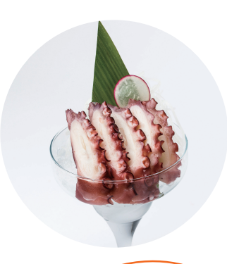
タコ OCTOPUS 7.5