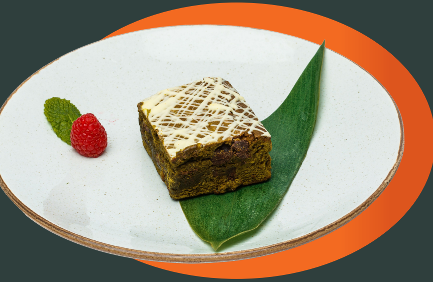
チョコレート抹茶ブラウニー バニラアイス添え Chocolate Matcha Brownie with Vanilla Ice Cream 6.9