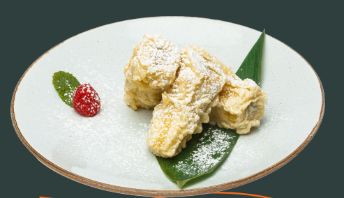
バナナフリッターバニラアイス添え Banana Fritter with Vanilla Ice Cream 6.9